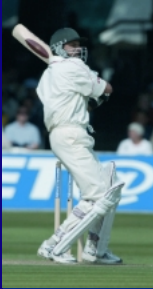
MAI cricket bats, used and recommended by SHAHID AFRIDI at Lords