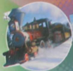
Disneyland Paris Resort Hotels